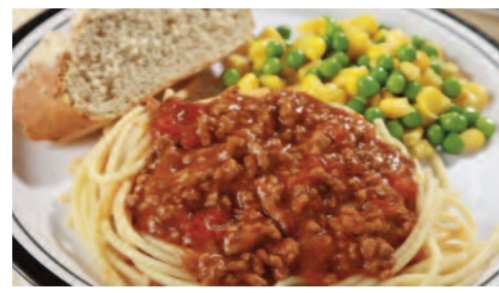
Spaghetti Bolognese served with Garlic & Herb Bread and Seasonal Vegetables