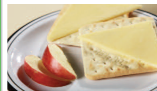
Cheese & Crackers