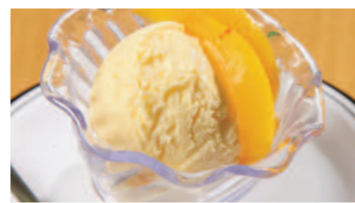
Ice Cream & Fruit