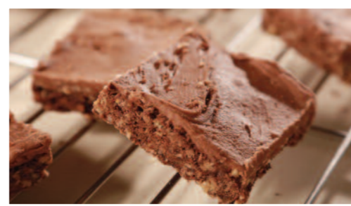
Iced Chocolate Oaty Square