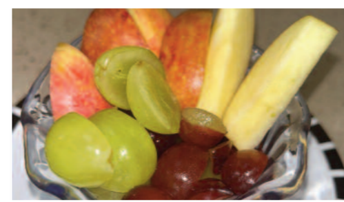
Apple & Grape Pot