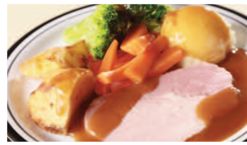
Honey Roast Gammon served with Roast/Mashed Potatoes, Seasonal Vegetables & Gravy