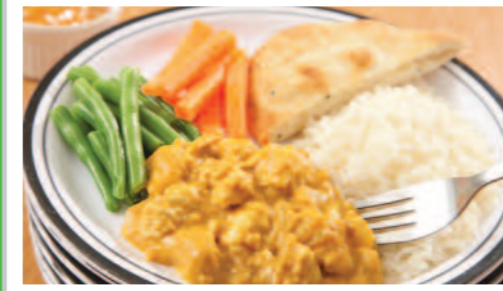
Chicken Korma served with Rice, Naan Bread & Seasonal Vegetables