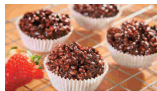
Chocolate Crispy Cake