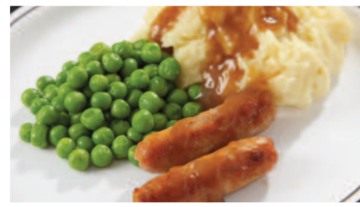
Sausages served with Mashed Potato, Seasonal Vegetables & Gravy