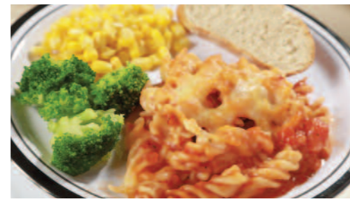
Cheese & Tomato Pasta served with Garlic & Herb Bread and Seasonal Vegetables