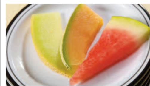
Trio of Melon