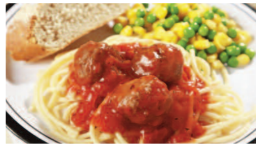
Meatballs in Tomato Sauce served with Spaghetti, Garlic & Herb Bread and Seasonal Vegetables