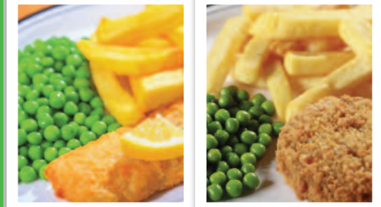
Battered Fish (MSC) or Salmon & Sweet Potato Fishcake (MSC) served with Chips & Peas or Baked Beans