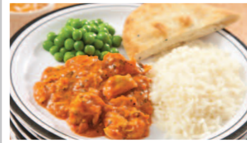
Chicken Tikka Masala served with Rice, Naan Bread & Seasonal Vegetables