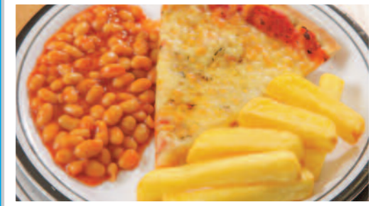
Cheese & Tomato Pizza served with Chips & Peas or Baked Beans

VEGETARIAN VERSIONS OF THE ABOVE MEAL AVAILABLE DAILY