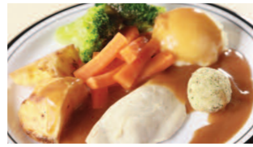
Roast Chicken served with Roast/Mashed Potatoes, Seasonal Vegetables & Gravy