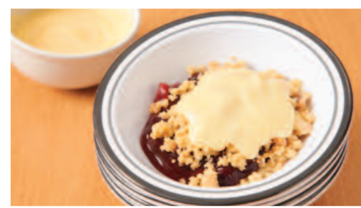
Fruit Crumble & Custard