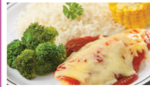
BBQ Chicken served with Savoury Rice and Seasonal Vegetables