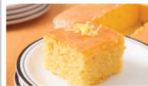
Lemon Drizzle Cake