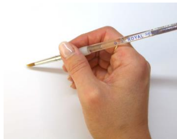
Holding a paintbrush correctly